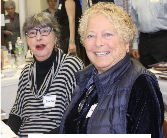
Community Passover Seder