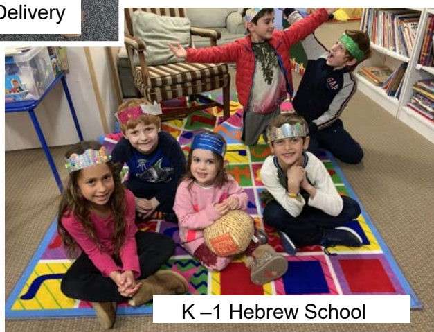
K-1 Hebrew School