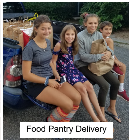
Food Pantry Delivery