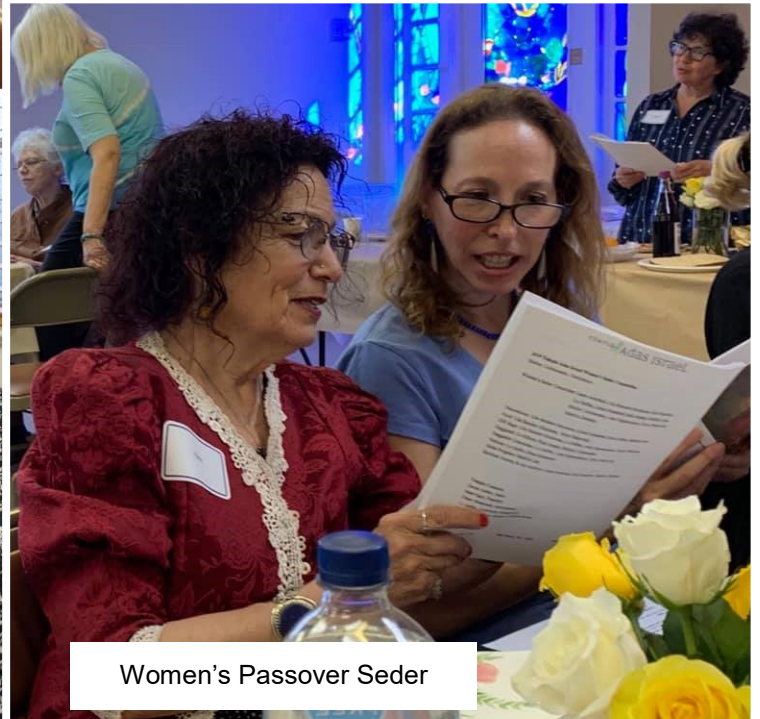
Women's Passover Seder