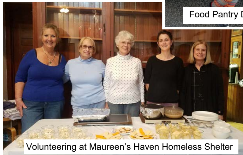
Volunteering at Maureen's Haven Homeless Shelter